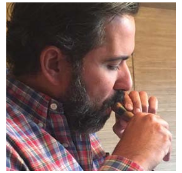
We learned about how cigars are made, how to smoke and appreciate them and finally how to pair them.