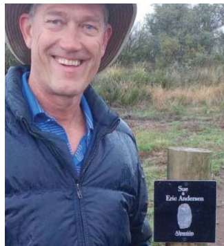
We proudly named the rows of our vineyards.