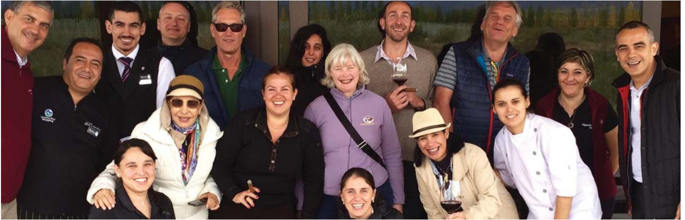
Last month a few of the investors met in Mendoza to discuss the wine business, future plans, etc.