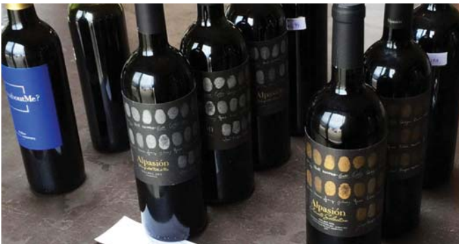
We did a vertical tasting of all of our wines and vintages: Alpasión Malbec 2011, 2012, 2013 and 2014 Alpasión Private Selection 2011, 2012 and 2013 WhataboutMe? 2014 and 2015 Magnum 2011